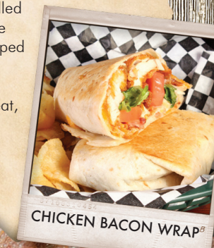
CHICKEN BACON WRAP

Crispy or grilled chicken, hickory smoked bacon, cheese, lettuce, tomato, onion, rolled with sauce and wrapped in your choice of flour, wheat, salsa, or jalapeño tortilla