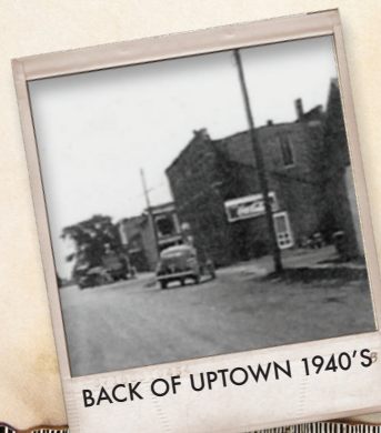
BACK OF UPTOWN 1940'S